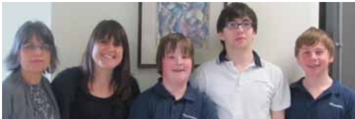
Top Left: JV Boys Basketball: