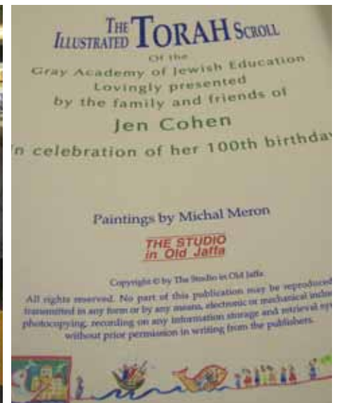
Left: Cohen Family At Dedication in January Right: Dedication Inscription